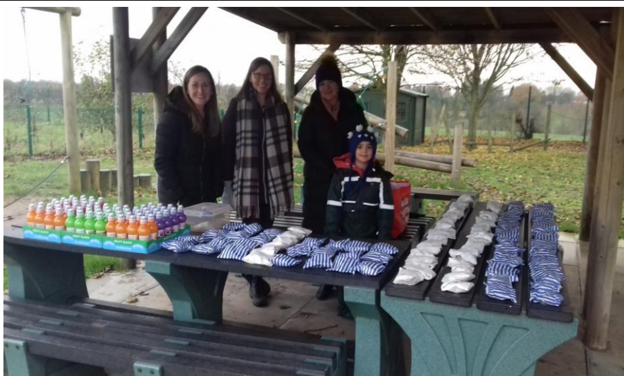
Christmas Tuck shop was fab, cold... but fab!