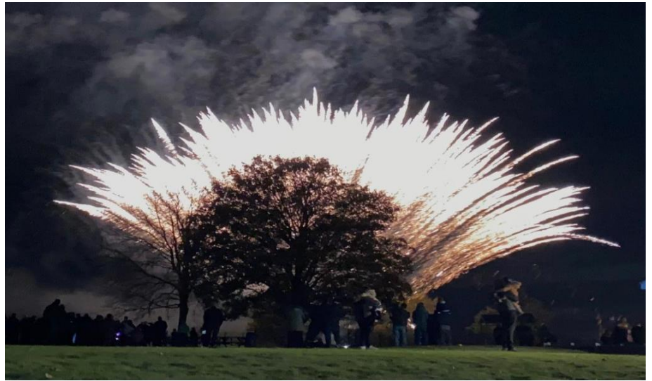
We loved hearing all the “Ooo’s” and “Ahh’s” from the crowd!